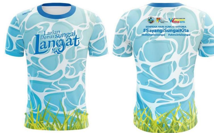
OFFICIAL EVENT TEE